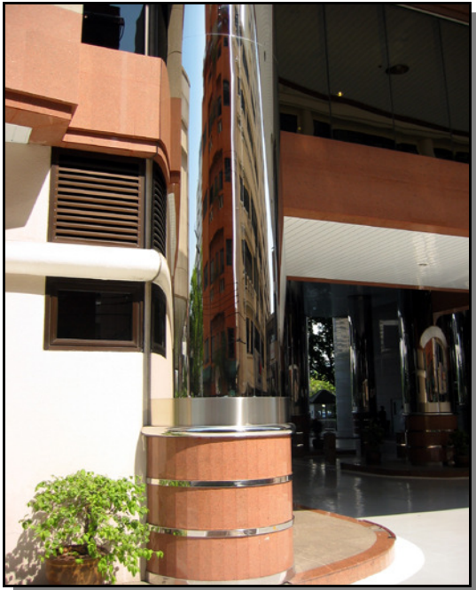
Super Mirror column