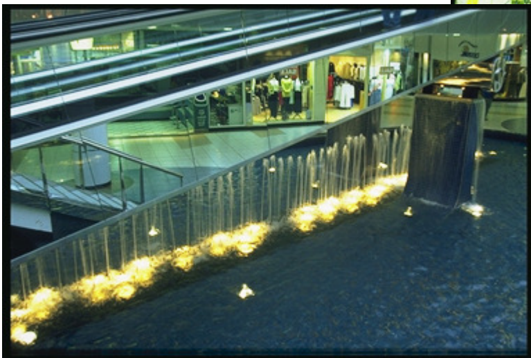
Escalator clad on sides and underneath with Super Mirror panelling